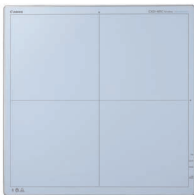
CXDI-401C Wireless (43x42cm)

Choose the DR Solution of the future and let our local, authorised Canon dealer advise you.