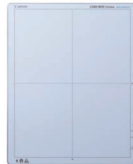
CXDI-801C Wireless (27x35cm)